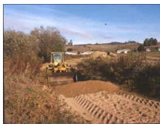
Clearing sand from creek bed

UCCE is a land-grant institution which conducts research on agricultural production practices and co-sponsors informational workshops, field days, and short courses for agricultural landowners and operators. Website: http://cemonterey.ucdavis.edu