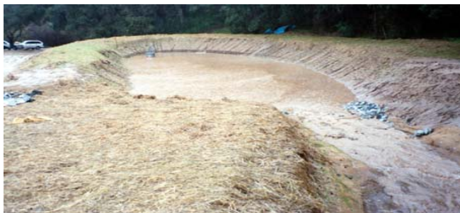
Sediment basin capturing stormwater runoff from fields

GOAL: Protect and improve water quality in the Gabilan watershed while helping farmers meet their production goals.